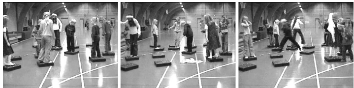
Figure 1 Sequence of children using the tiles as stepping stones.

In the situation we describe here, fourteen of these tiles were delivered to a primary school's activity rooms and outdoor playgrounds, where school children (aged between 7 and 12) were free to play with them. The activities we detail here were spontaneous in the sense that the children engaged with the tiles without instructions or suggestions from the project team. In these cases, the tiles simply were placed at the school for the students to play with as they wished. Each of these "games" emerged from their play.