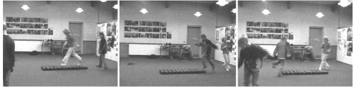
Figure 2 Sequence of children playing with rows of tiles.