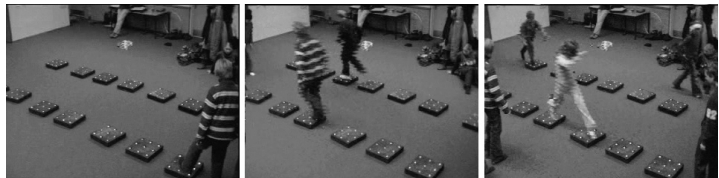
Figure 3 Sequence of images of the line race.

One unexpected property of the tiles emerged through our observations of the children's play. A number of the tiles' sole function (the ability to change color from red to blue and back again to red) was inconsistent, due to variations in the material tolerances of their construction. Sometimes when children stepped on a tile, it wouldn't change color. Then maybe, as they stepped off of it, the pressure of switching to one foot and transferring their weight as they moved would work to change its color to blue. This "inconsistency" proved to be consequential to a number of the uses to which the tiles were put. For example, several groups of children arranged a series of tiles into rows, "setting up" the lane by switching all of the tiles to red, for instance. On one occasion, two girls created such an arrangement with four tiles (Figure 2). They then took turns to run across all of the tiles, attempting to change the color of each tile as they stepped on it. Several times, however, at least one or two of the tiles would stubbornly remain red, in spite of the fact they were stepped on. This presented the next girl with a row that had "gaps" (one or more unchanged tiles). She then used the remaining pattern as a challenge: only step on the altered tiles. Multiple patterns of red and blue tiles emerged from a combination of the tiles' being used in this way and their functional inconsistency. These worked in concert to increase the challenge of the game.