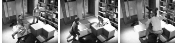
Figure 5 Sequence of interaction with Twistyertouch.

Children also discovered and seized upon the absence of certain rules of the game (i.e., moves that did not have consequences for play). During play, some children realized that it didn't matter if, in the process of trying to reach one specific cushion, they accidentally activated a cushion of another color, as long as not too many cushions of any one other color were activated. Thus, activating the "wrong" cushions became used as a means to move across the mat in order to activate the "right" ones more quickly—children would step on a blue tile on their way to kicking a yellow one in, saving them the time it would take to hop off the Twistyertouch and run around it to the next yellow cushion.