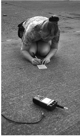
Figure 1 Participant engaging in sensor scavenger hunt.

environmental sensing, using professional sound-level and air-quality sensor platforms. We began the first session with a sensor scavenger hunt—an activity designed to excite participants and to encourage exploration of both the technology and the neighborhood (see Figure 1). As an activity, the sensor scavenger hunt builds on prior work in participatory design that investigates the use of playful approaches and games to motivate participation, stimulate creative and critical thinking, and overcome hesitancy to using unfamiliar technology. 6