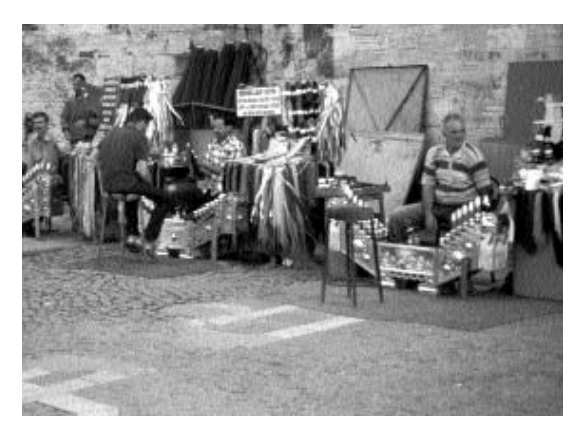
Taksim Square, Istanbul

One can see two basic typologies; elaborate boxes with stepped sides that serve as bins for multiple bottles of polish—each topped with a shiny cap-and simpler flatter boxes, usually with fewer bottles. In some cases, the boxes display original paintings, like miniature murals on building walls, and in other instances collages of cut out magazine pictures are pasted on the box facades. In travels throughout western Turkey, I never saw two boxes that were exactly alike. The variety of these boxes, which fit no existing category of decorative art or even folk art, is a testament to the popular imagination and to the potential of finding aesthetic pleasure in the most unexpected places.