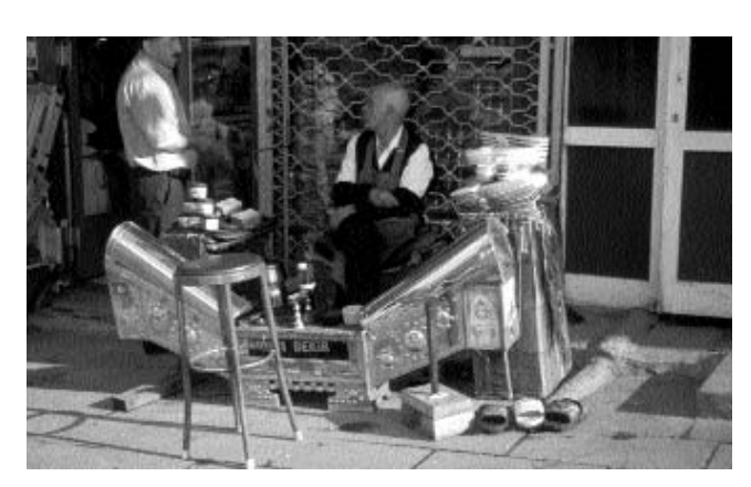
Bus station, Ankara