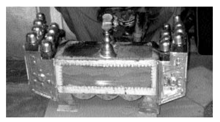
Taksim Square, Istanbul