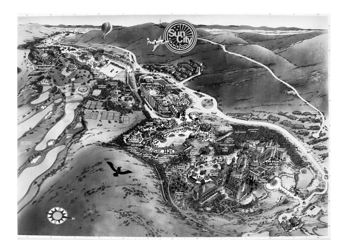
Figure 3 Map of Sun City, NuMap of Sun City (Johannesburg: Sun International, 1992). Original size 60 x 42cm.

the territory has been mapped, the visual abstract of the map not only orients and corroborates, but also shapes peoples' expectations, giving lie to its putative similitude.