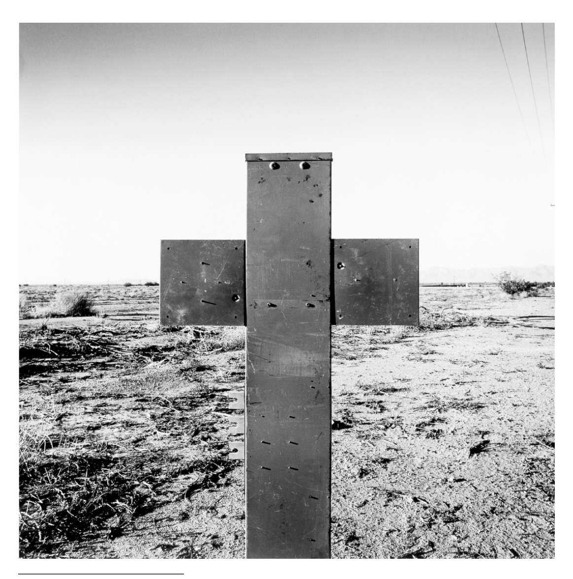
Figure 1 North Royce Road north of West Roberts Road, Sonoran Desert.