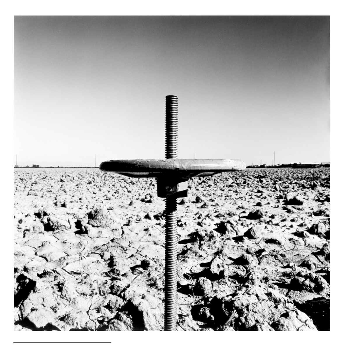
Figure 5 Arizona Avenue at Pecos Road, Sonoran Desert.