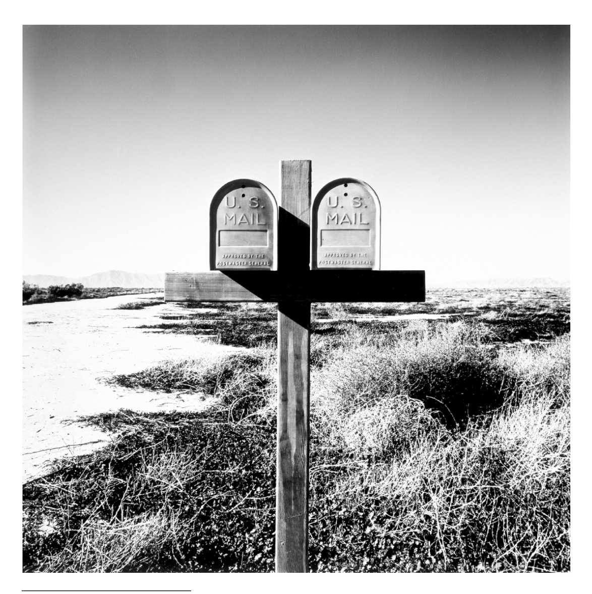
Figure 4 East Mossy Rock Drive west of South Price Road, Sonoran Desert.