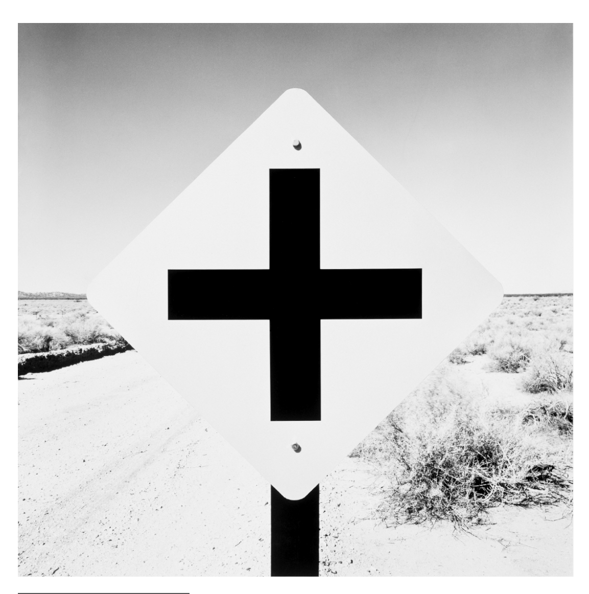
Figure 2 Ranchview Road at Sierra Vista Road, Sonoran Desert.