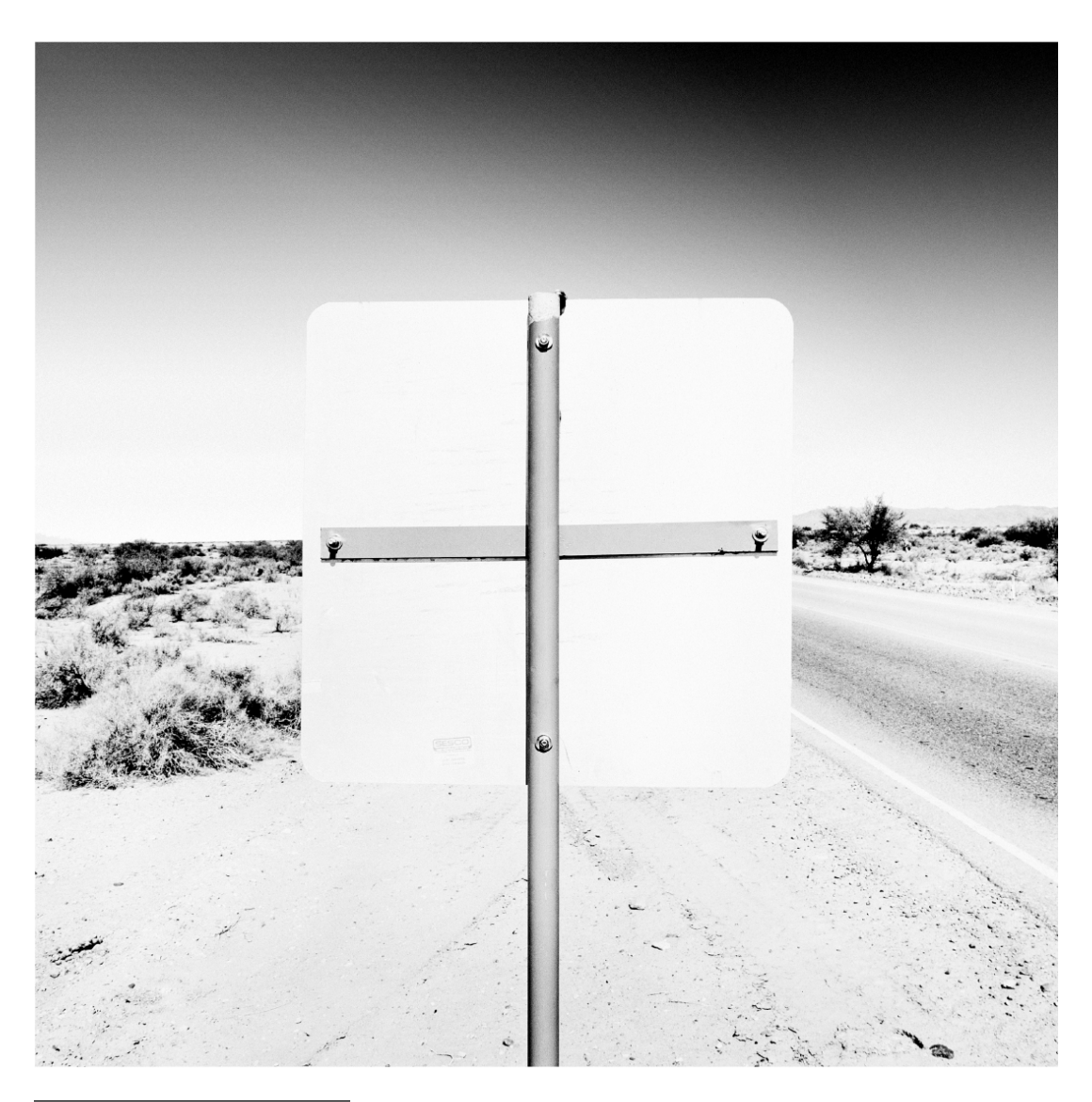
Figure 6 State Route 347 at Maricopa Road, Sonoran Desert.