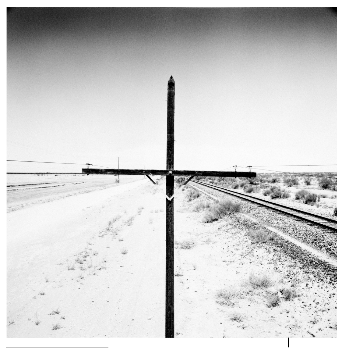
Figure 7 North Drifter Pass Road at Wrangler Road, Sonoran Desert.