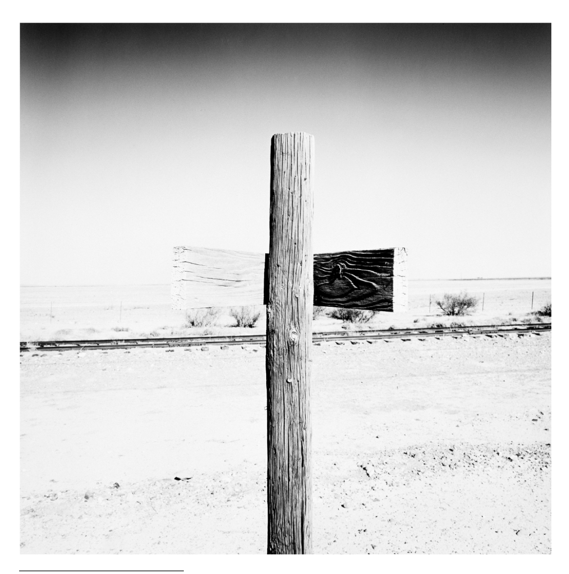
Figure 3 State Route 285 south of Toyah Creek, Chihuahuan Desert.