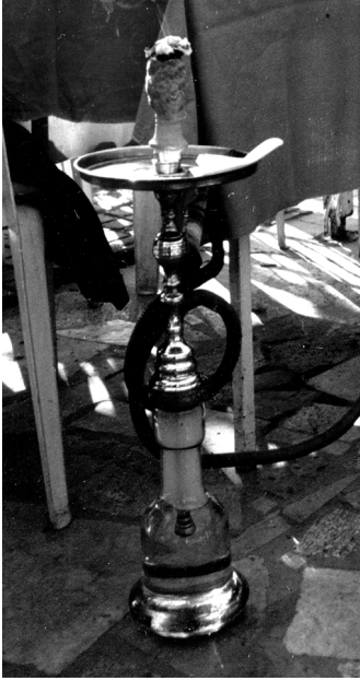
Figure 1 Detail from a nargile.

the pipe bowl ( liile ), the body ( gövde ), the flexible hose ( marpuç ), and the metal tube ( ser ). Pipe bowl refers to the upper part, usually made from clay (In the example shown, it is metal) in which the tobacco is burned using charcoal. The metal tube connects the pipe bowl to the body. The body is the main part; usually glass, metal, or crystal; that holds the water. A flexible, hose-like pipe is used to convey the smoke to the user. It is connected to the body through a junction on it. Each piece is produced by specialized craftsmen, and sold in specific districts of the town in which they are produced. 5