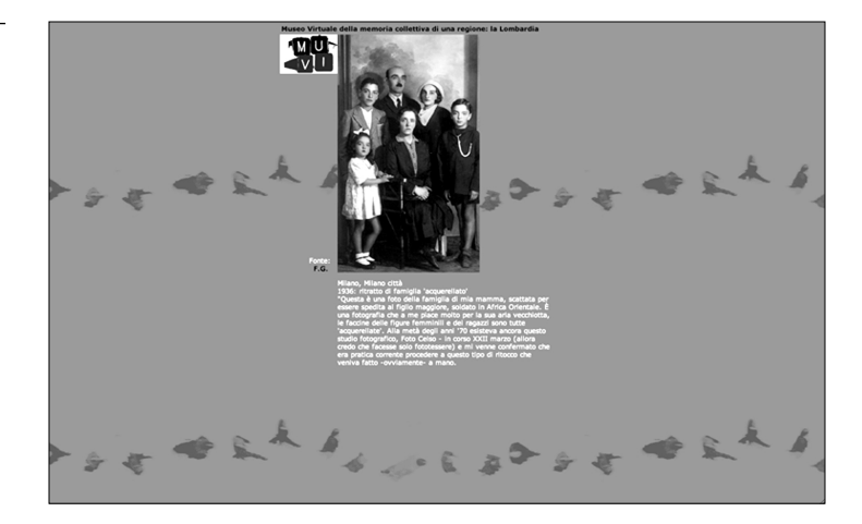
Figure 4 Pictures from the MUVI database

process that invited people to look at each other and exchange their own values by sharing the pleasure of telling their own stories and listening to those of others. The safekeeping of the collective memory begins in MUVI with the sharing of a personal memory, and it ends up with interweaving family memories and history.