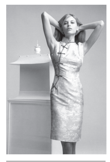
Figure 10 Shangai Tang, Pagoda Print Qi Pao, 2003.

Mansion, provided a theatrical staging for nouveau riche American aspirations-stately English aristocratic room "sets" in dark wood and finished with family portraits complete the fantasy of tradition for a newly wealthy clientele who have none. Lauren presents a pastiche of American nostalgic styles, reflecting a yearning for tradition, stability, and history in a rapidly changing society. Shanghai Tang produces a similar nostalgic "stylism," with similar theatrical set interiors suggesting that, while the content they sell (Chineseness) is "local," the forms and marketing are imported. What differentiates the two brands is that, unlike Tang, both Lauren's designs and his public persona are imbued with an aura of authenticity and sincerity at odds with Tang's parody and playfulness. Lauren's styles, while on the one hand particularly American, on the other seem to have crossed cultural boundaries with ease to become part of a global fashion language. While the global appeal of Lauren's clothes can be explained by the postwar spread of American popular culture, particularly Hollywood cinema, Shanghai Tang's appeal is less obvious.29