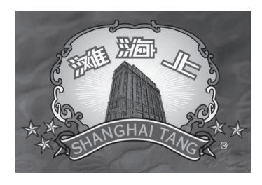
Figure 8 Shanghai Tang, logo. Permission of German Elkin-Kobahidze.