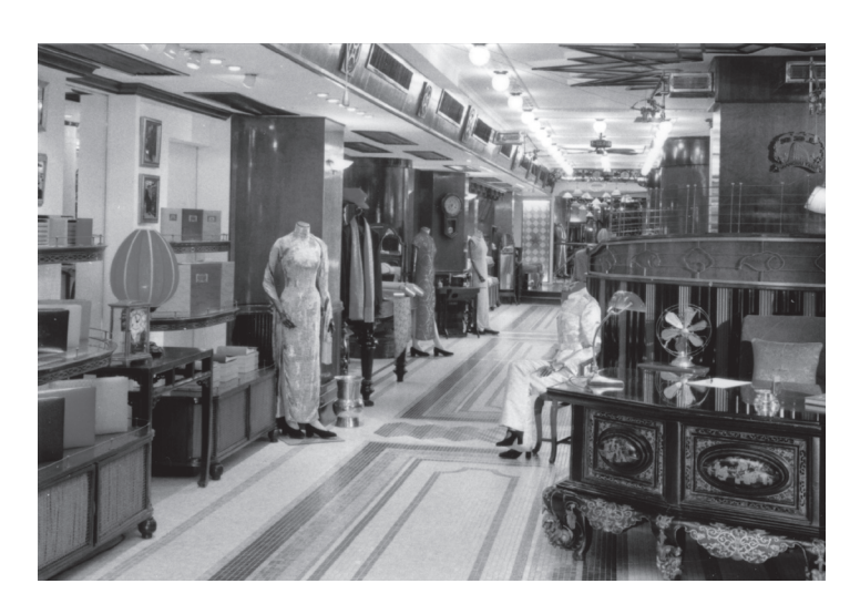
Design Issues: Volume 25, Number 2 Spring 2009