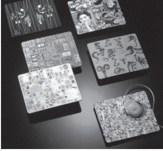
Figure 5 (top) Alan Chan Creations coaster set. Permission of Alan Chan.

Figure 6 (bottom) Alan Chan Creations, Calendar Girls mousepads. Permission of Alan Chan.