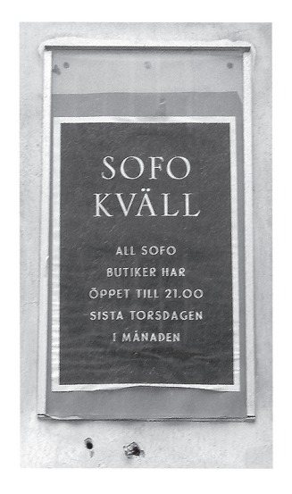
Figure 4 Example of a design district activity, SoFo, Stockholm. Translation: "SoFo evening. All SoFo shops are open until 9 p.m. every last Thursday of the month."

All districts organize activities to increase awareness of what is in these districts. For example, they educate journalists by organizing tours in the districts, and giving them promotional material. Similarly, walking tours and late-night shopping events are organized for the public (Figure 4). The Avenues of Art and Design, for example, sponsors the "Art and Design Walk" in June. During the Walk, the district becomes a big open house in which about 100 to 150 businesses participate. During the Walk, The Avenues' BID arranges exhibits and other social activities outside the stores; while individual stores provide wine and food, and organize other events to entertain visitors. One of the centers of global art world,