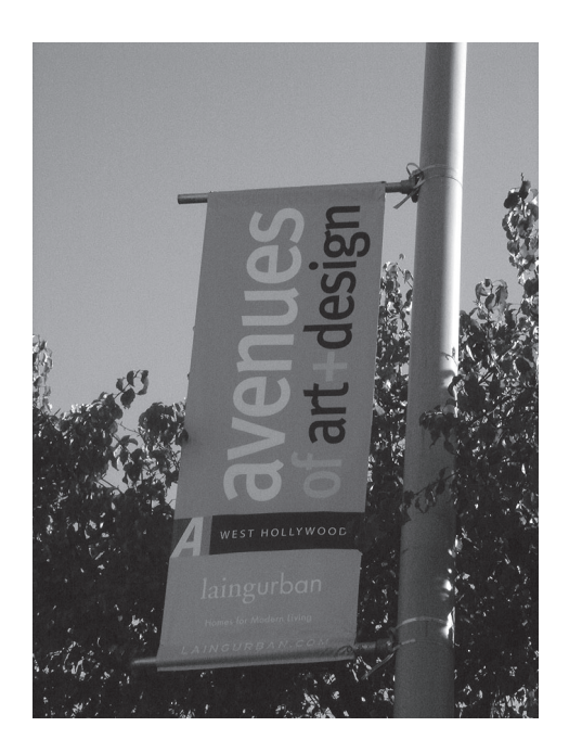
Figure 2 Example of the street image of the districts: Los Angeles. Note that this is The Avenues's old identity. Picture by IK, October 2006.

The organizations provide merchants with a forum for exchanging opinions and finding common interests among the districts' design businesses. Based on these common interests, districts can be given identities; strategies can be created to shape these identities; and resources can be pooled to make the strategy real. For example, in 2006, Helsinki's Design District spent 35,000€ to create a marketing strategy, and took out a bank loan of 18,000€ in order to fund the campaign. It is not in the interest of any individual design business owner to devote such sums to promoting the common good: a design district uses collective action to solve this problem. Identity management extends to the media, street, and virtual presence. In designing the district identities, one of the main drivers has been to make them discreet enough not to disturb the visual face of shops.