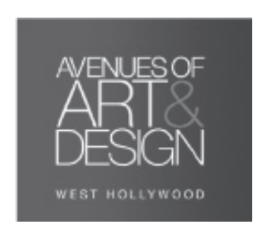
Figure 1 (above) Example of a logo: The Avenues of Art and Design, West Hollywood. Logo courtesy of Alexander Stettinski.

a virtuous cycle develops. Merchants locate in the neighborhood because they know that consumers go there for design. Consumers, on the other hand, go to the neighborhood because they know there are design shops they can browse in. Representations such as shopping maps are essential elements in this process through which some neighborhoods come to be characterized by the design trade.<sup>9</sup>