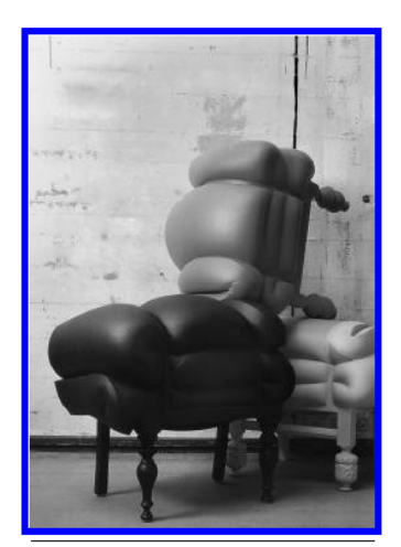
Figure 3 Madam Rubens by Frank Willems.

importance for the purposes of re-valuation. Only after the second burial can we manage to totally be rid of the object; in other words, "only when all forms of value have been exhausted or translated and thereby stabilised will the object be permitted to undergo its second burial."