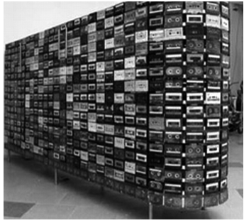
Figure 2 Cassette Cabinet by Patrick Schuur.

the compact disc age, you're stuck with cassette tapes filled with dated music and emotions, but all's not lost. Creative Barn shows how tapes can serve a more valiant purpose than collecting dust.<sup>39</sup>