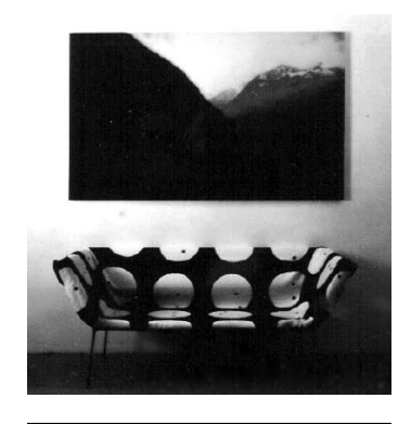
Figure 5 Franz West Knutschnische 2000, Environment with work by West 2000, Steinbach, Gelatin 2000, mixed media dimensions variable.

because it is something you can acquire an attitude from if you want to appear profound while, at the same time, producing something to go on your wall.