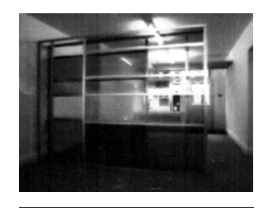
Figure 2 Liam Gillick, Big Conference Centre Limitation Screen, 1998. Anodized aluminum, Plexiglas, 300x240 cm.

5 Clement Greenberg, "Recentness of Sculpture" (1967) in Clement Greenberg: The Collected Essays and Criticism, Vol. 4, John O'Brian, ed. (Chicago and London: The Unviersity of Chicago Press, 1993), 254.