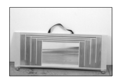
Figure 4 Joe Scanlon Prop 2, 2001. Wood, fabric, metal, rubber, and lacquer. 17 x 40 x 11/2 inches (43.2 x 101.6 x 3.8 cm).

Kelly and Kenneth Noland set an example to be followed as they "rise above Good Design" while utilizing formal elements derived from design, in particular from the Bauhaus. Even though all this was many years ago, it came as no surprise when the most recent design art came to the attention of critics in the late-1990s that the same terminology was used again. According to some critics and artists, especially the ones still under the influence of Judd's generation, Pardo's work nestles easily within the confines of good design. And so, once again, the high art of one generation is seen as the good design of another.