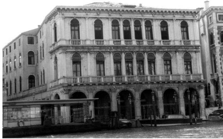
Figure 3 Palazzo Corner on the Canal Grande.