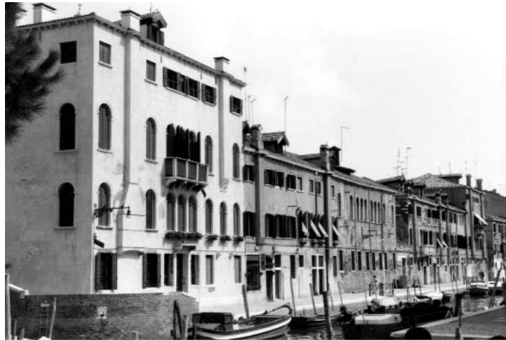
Figure 4 Case Moro on Rio San Girolamo.