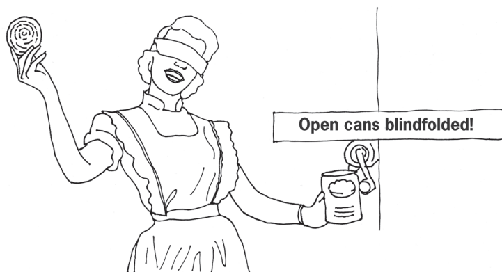
Image 1 Atomic Kitchen advertisement Redrawn for the authors by Ellen Lupton.