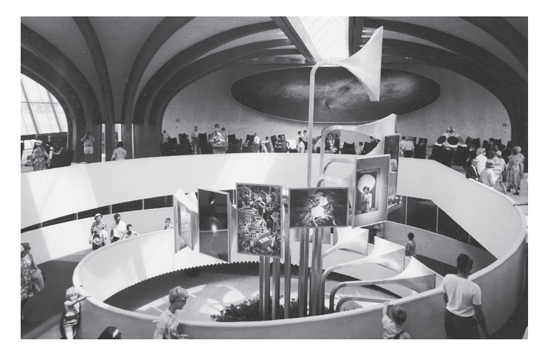
Figure 7 Central ramp to main exhibition hall, Australian Pavilion, Expo'67. Montreal, NAA: AA1982/206, 45.

the 1960s was one in which modernization forces spread out over the world; but the priority of a modern aesthetic as a representation of contemporary Australia disturbed the expectation that national pavilions be visibly tied to the identity of their home countries.