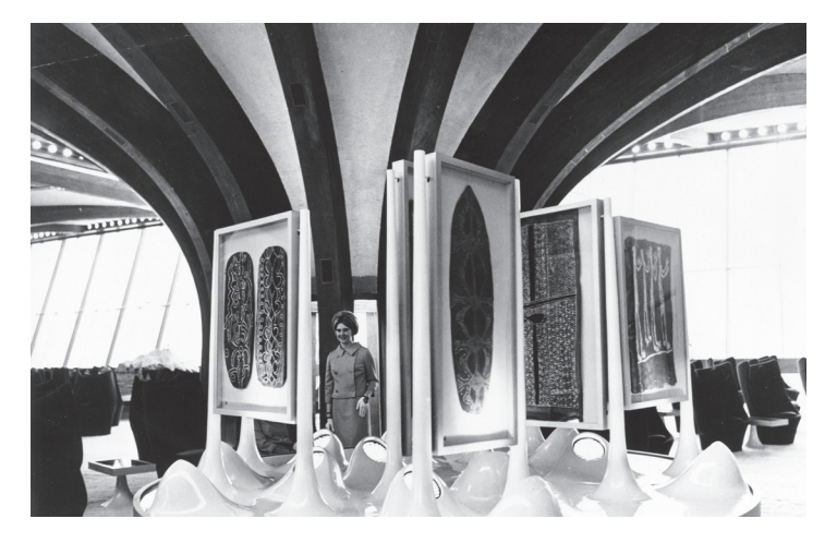
Figure 6 Indigenous bark paintings, Australian Pavilion, Expo '67, Montreal, NAA: AA1982/206, 44.

pavilion, Boyd commissioned Australian artists to create large panels as original creative works to articulate key aspects of the display. The model of the Parkes radio-telescope, for example, sat beneath a panel by the Australian artist Donald Laycock that depicted the night sky of the southern hemisphere in a painterly, abstract style.