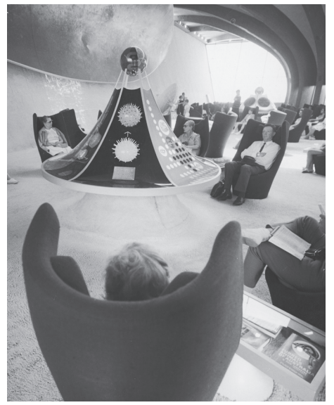
Figure 1 (left) 1 Hostess with model of the Parkes Radio Telescope, Australian Pavilion, Expo '67, Montreal, NAA: AA1982/206, 44. Reproduced with permission of the National Archives of Australia.

Figure 2 (right) Interior view of main exhibition hall, Australian Pavilion, Expo'67. Montreal, NAA: AA1982/206, 45. Reproduced with permission of the National Archives of Australia.