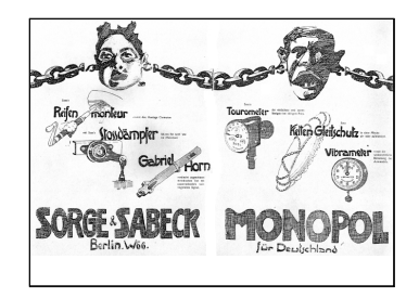
Figure 10 Ernst Neumann, Advertisement for Sorge und Sabeck automobile parts in Motor , a technological journal, ca. 1908.