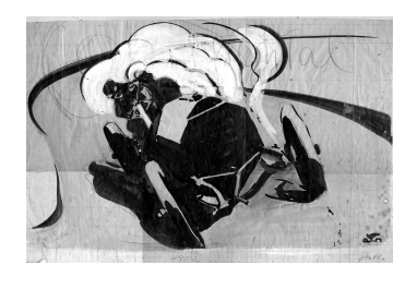
Figure 7 Ernst Neumann, Poster sketch for Continental Tires, 1902–03, pencil and gouache.

Ours are lives uncannily fast in action:—On a sultry day in northern Berlin I passed a large storage area. On the enormous surface it contained nothing but rusting, discarded machine parts, boilers that were burst, all possible types of mechanisms, which had only a few weeks before traversed large areas of life. However, no poetic legend stood over the entrance, rather a somber company sign.<sup>41</sup>