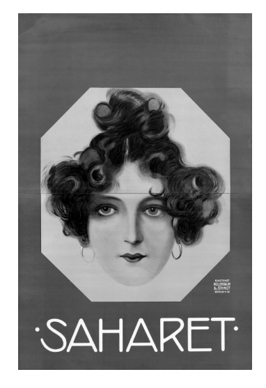
Figure 2 Hollerbaum and Schmidt, Saharet , 1903, color lithograph poster, 135 x 90.5 cm.