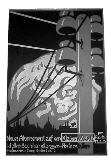
Figure 5 Ernst Neumann, New Subscription to Kladderdatsch at all Bookstores and Post Offices, 2.25 Marks per Quarter-Year, 1899, 69.5 x 46.5 cm.