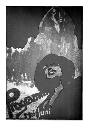
Figure 3 Ernst Neumann, Cover of program for The 11 Executioners, May—June 1902, color lithograph.

Arising from Greek mythology, the term "panicked shock" described the impact of Pan's appearance in the heat of mid-day on people and herds of animals —a moment when the normal sense of natural and human order was disrupted by a sudden event, producing disorientation and anxiety.<sup>23</sup> Arnold Böcklin had represented the effect in two paintings of 1860; and Pan's hybrid form, which forced