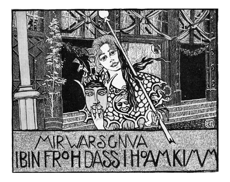
Figure 4 Ernst Neumann, "Liberated Art (at the conclusion of the exhibition in the Glass Palace)," Simplicissimus 2:32 (1897):