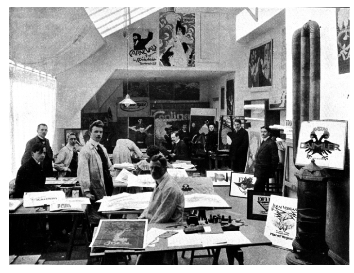
Figure 11 (right) Ernst Neumann, "Behind the Scenes of Modern Advertising," brochure for Neumann's advertising studio, ca. 1911–12.

advertisement in a technology journal (figure 10), however, was very different in approach, although equally unlike typical print ads. It combines extremely objective drawings of automobile parts with broader style above that caricatures two male heads, which are linked by heavy chains that are hooked to their ears and move to and fro in space—an extremely startling and grotesque image that seizes the reader's attention, while also linking the two pages.