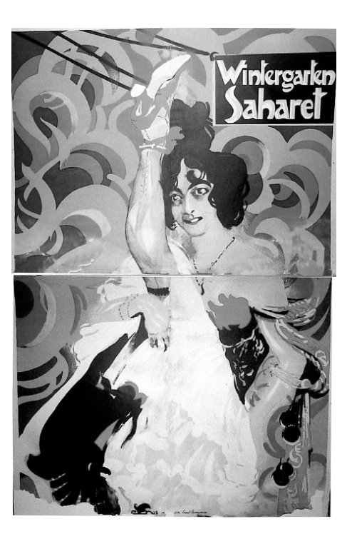
Figure 1 Ernst Neumann, Wintergarten Saharet , 1903, color lithograph poster, 135 x 92 cm.

© 2005 Massachusetts Institute of Technology Design Issues: Volume 21, Number 3 Summer 2005