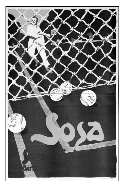
Figure 9 Ernst Neumann, Sosa. Sorge and Sabeck , 1908, color lithograph poster for tennis balls, 130 x 84 cm.