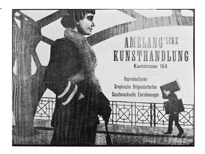
Figure 8 Georg Braumüller, Amelang's Art Gallery , 1903, lithograph poster, 64 x 87 cm.