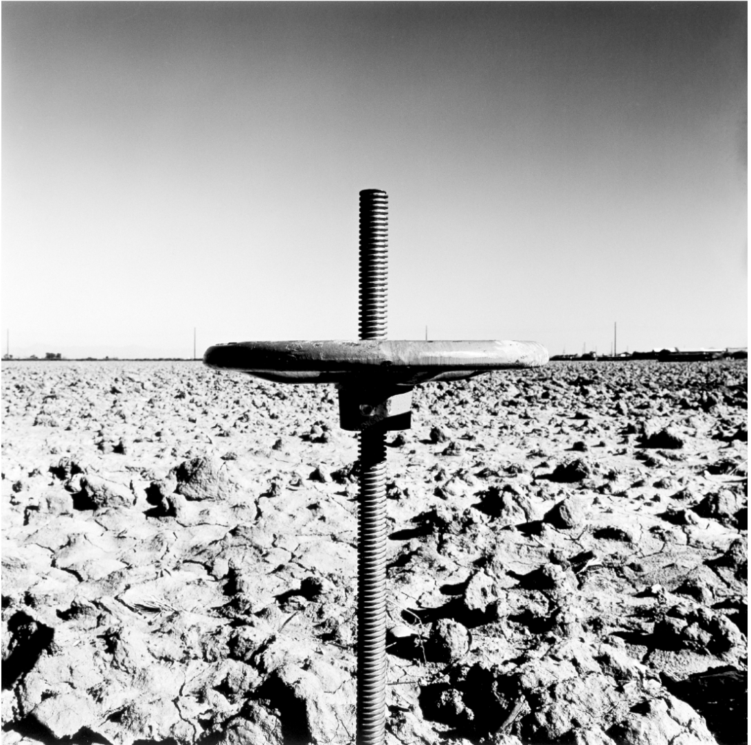
Figure 5 Arizona Avenue at Pecos Road, Sonoran Desert.