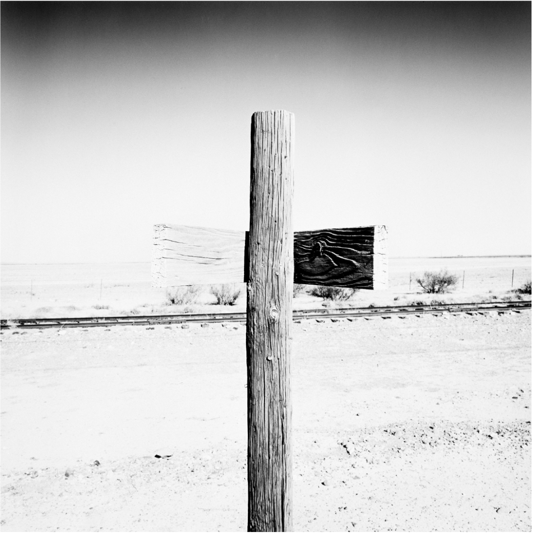
Figure 3 State Route 285 south of Toyah Creek, Chihuahuan Desert.