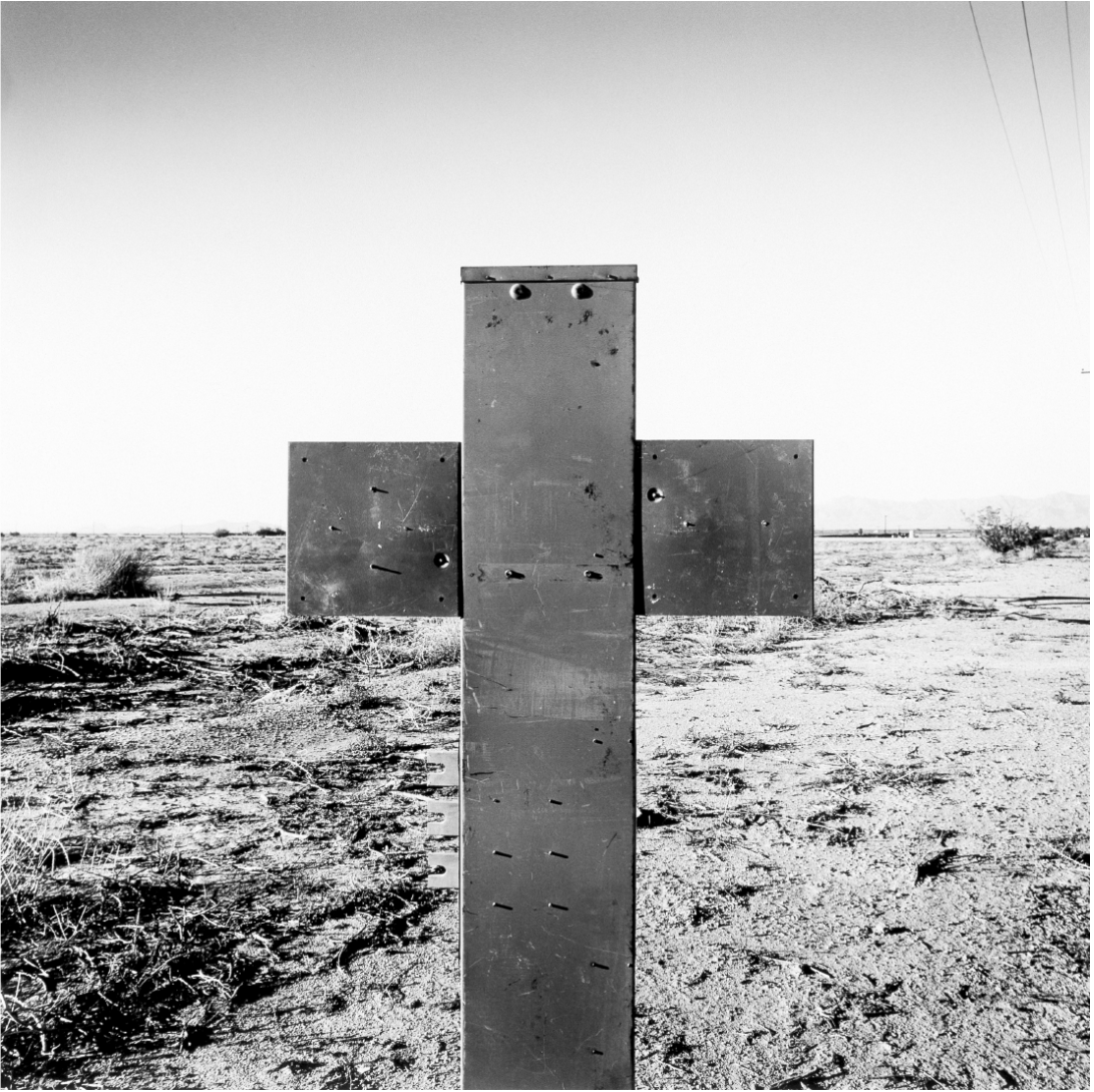
Figure 1 North Royce Road north of West Roberts Road, Sonoran Desert.