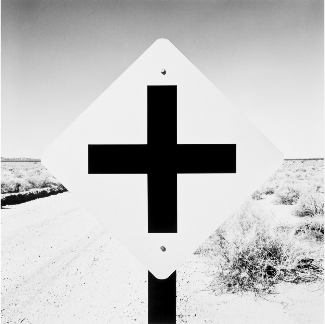
Figure 2 Ranchview Road at Sierra Vista Road, Sonoran Desert.