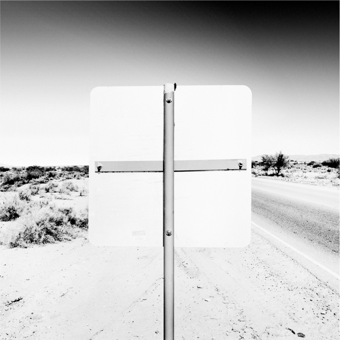
Figure 6 State Route 347 at Maricopa Road, Sonoran Desert.