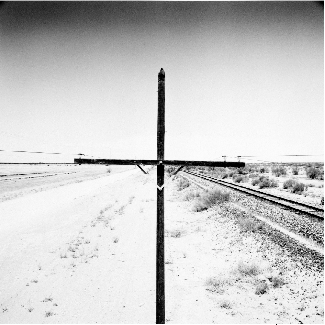
Figure 7 North Drifter Pass Road at Wrangler Road, Sonoran Desert.