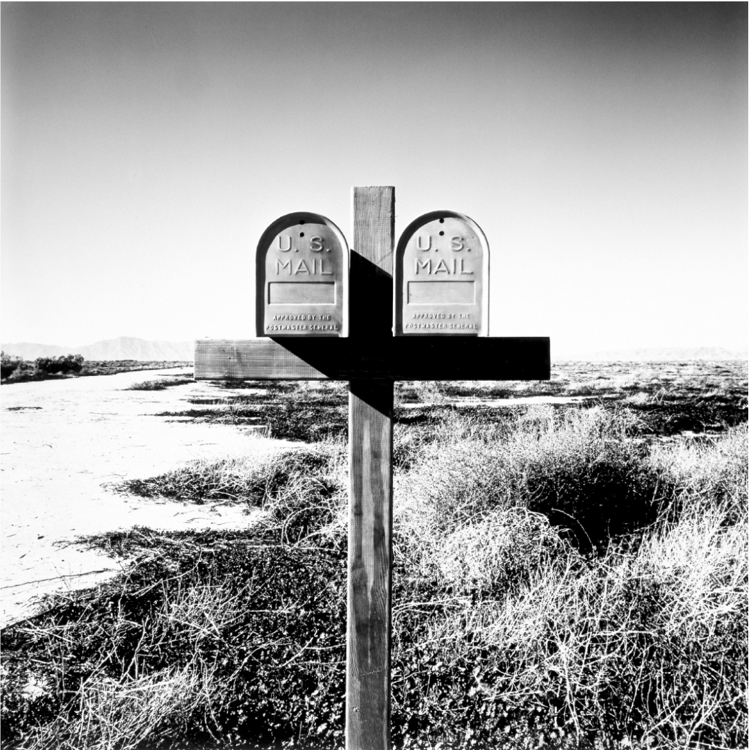
Figure 4 East Mossy Rock Drive west of South Price Road, Sonoran Desert.