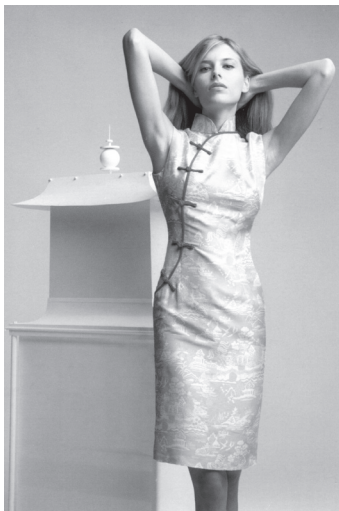
Figure 10 Shanghai Tang, Pagoda Print Qi Pao, 2003.

Mansion, provided a theatrical staging for nouveau riche American aspirations—stately English aristocratic room “sets” in dark wood and finished with family portraits complete the fantasy of tradition for a newly wealthy clientele who have none. Lauren presents a pastiche of American nostalgic styles, reflecting a yearning for tradition, stability, and history in a rapidly changing society. Shanghai Tang produces a similar nostalgic “stylism,” with similar theatrical set interiors suggesting that, while the content they sell (Chineseness) is “local,” the forms and marketing are imported. What differentiates the two brands is that, unlike Tang, both Lauren’s designs and his public persona are imbued with an aura of authenticity and sincerity at odds with Tang’s parody and playfulness. Lauren’s styles, while on the one hand particularly American, on the other seem to have crossed cultural boundaries with ease to become part of a global fashion language. While the global appeal of Lauren’s clothes can be explained by the postwar spread of American popular culture, particularly Hollywood cinema, Shanghai Tang’s appeal is less obvious. 29