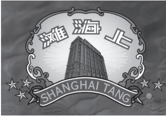
Figure 8 Shanghai Tang, logo.