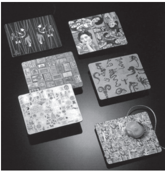
Figure 6 (bottom) Alan Chan Creations, Calendar Girls mouse-pads. Permission of Alan Chan.

Firstly, the illustration technique and the attention to detail is unique.... Secondly, the concept of Chinese women seen from a European perspective is particularly interesting. I was trying to find a solution that would appeal to both Western and Chinese tastes. From a commercial point of view these paintings of fashionable Chinese ladies, as seen from a Western perspective and illustrated by both Oriental and Western technique, are a sound formula. 14