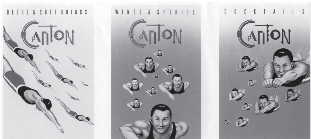
Figure 1 Alan Chan, Canton Disco menus, 1984. Permission of Alan Chan.

Chan is best known for his nostalgic designs; an early example of which is his visual identity for the Canton Disco (1984), which included signage, menus, coasters, and stationery (Figure 1). The menus feature a repeated motif of a swimmer against a flat background of bright green, pink, or yellow (a different color for each type of menu). The swimmer, with his slicked-back hair and 1930s bathing costume, was appropriated from an old cigarette card, illustrated in a Western style. With its decorative line work and irregular lettering, the logo is clearly influenced by contemporary