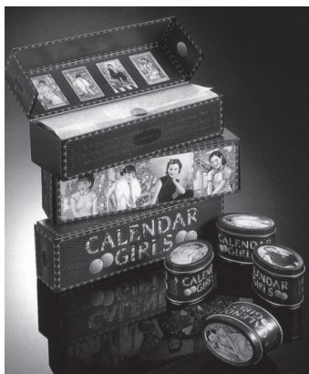
Figure 4 (bottom) Alan Chan Creations, Calendar Girls notepads. Permission of Alan Chan.