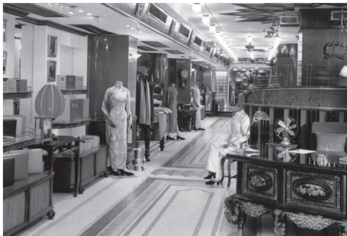
Figure 7 Shanghai Tang, interior of Pedder Street store.

Tang's other significant cultural venture, the upmarket department store Shanghai Tang, sought to recreate the glamorous decadence of 1930s Shanghai. The store features not only men's, women's, and children's clothes; but also shoes, accessories, and home furnishings including cushions, photo frames, towels, and teapots. Readymade clothes primarily are variations on traditional Chinese clothing in bright colors and patterns in a variety of luxury fabrics such as silk, leather, suede, and cashmere, finished with fine detailing including the ubiquitous Chinese "frog" clasps or knot buttons. The store also offers an "Imperial Tailors" service, which "revives the diminishing art of Chinese haute couture" via a team of "traditional Shanghaiese tailors," some of whom fled Shanghai during the Cultural Revolution to settle in Hong Kong. 26 The tailoring service offers unique hand-cut and handsewn, made-to-measure fashion in luxurious materials. The flagship store in Hong Kong's Central district opened in 1994, and global expansion began in 1997 with a store on New York's fashionable Madison Avenue (closed two years later, but subsequently reopened nearby), followed by stores in Singapore, Shanghai, Beijing, London, Bangkok, Honolulu, and Paris,