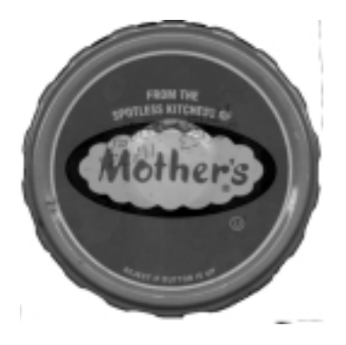
Figure 3 Jar lid for Mother's products.

The Orthodox Union's 'hechsher." Copyright Orthodox Union, New York, NY. Reproduced by permission. (tm)