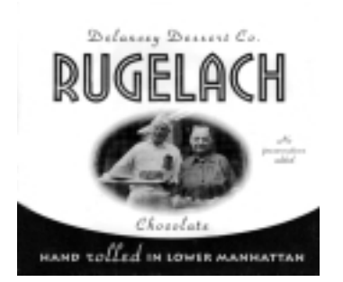
Figure 13 Delancey Dessert Co. Rugelach.