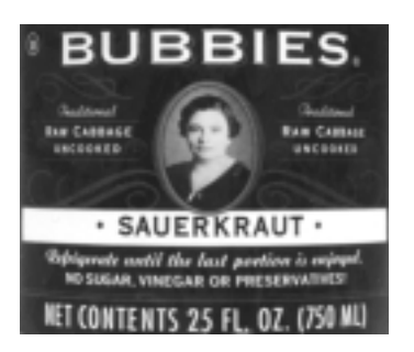
Figure 6 Bubbies Sauerkraut.