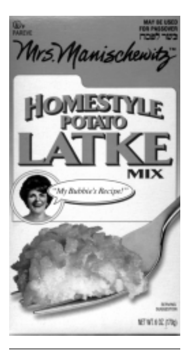
Figure 8 Mrs. Manischewitz Latke Mix.