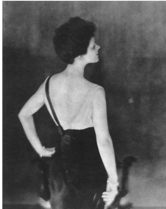
Baron Adolf de Meyer. Rita de Acosta Lydig , ca. 1913. Photograph. The Metropolitan Museum of Art, Gift of Mercedes de Acosta, 1968 (68.615)

Any witness observes and any mirror reveals the front. The back might remain a secret, or might, perhaps, be perceived only incompletely or intermittently. Further, a person whose back and derriere are being looked at may have no knowledge that the body is being witnessed. The back literally avoids confrontation, yet it may no less (and perhaps even more) invite the gaze. Somatic psychologists might doubt the back’s role as an erotic sign, but the spine’s unerring course from neck to buttocks is an erotically charged path. Moreover, the metaphoric quintessence of the spine is character and identity,