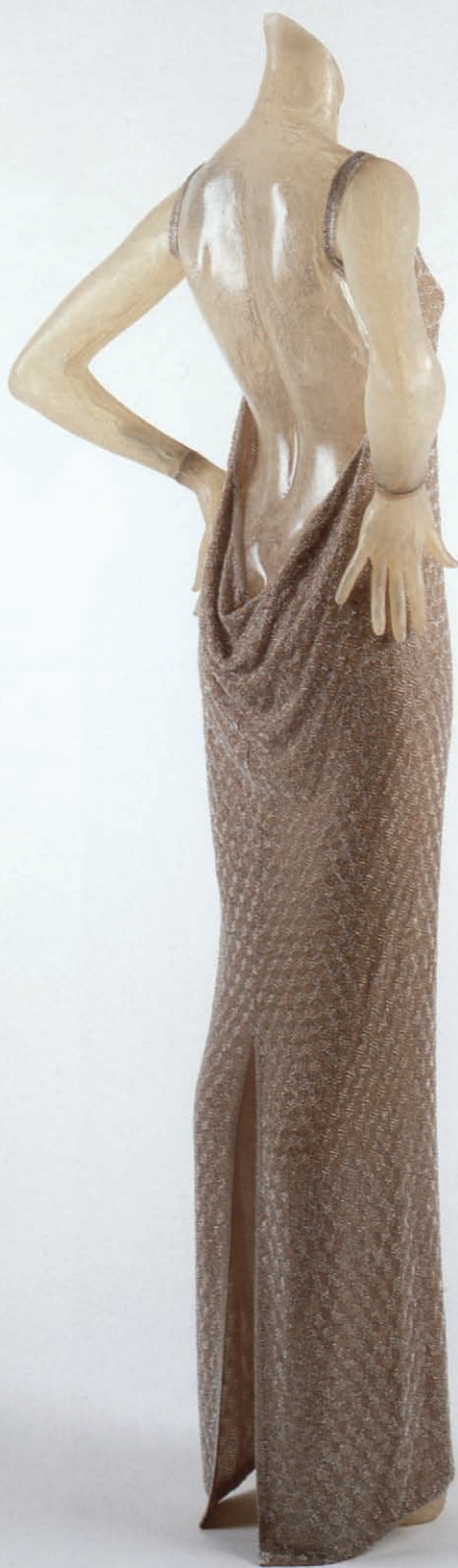
Isaac Mizrahi Evening gown, fall/winter 1990-91 Bois-de-rose seed-bead embroidered silk chiffon

Mizrahi touches on exposure of the back with an additional energy, revealing an erotic frontier of posterior cleavage. Inspired by dresses of the 1930s and the Hollywood glamour of that era, Mizrahi achieves similar magnetism and bombshell effects in the nineties.